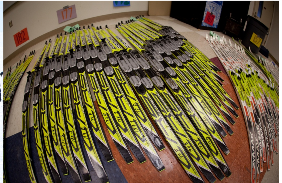
70 sets of equipment left in the region