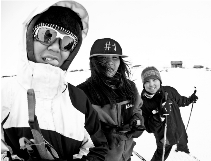
Elvina “the Photographer”